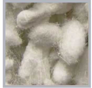
advanced STERLING filter media