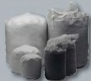
STERLING media to fit any brand