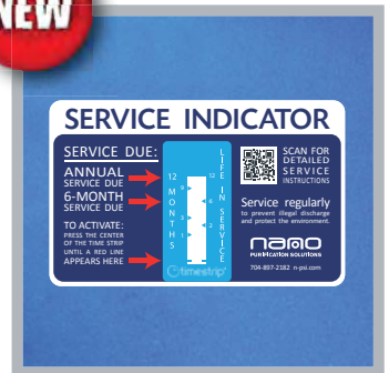
never miss a media replacement