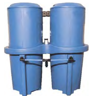
two tower SEP 1800 & 2500: Innovative & cost effective