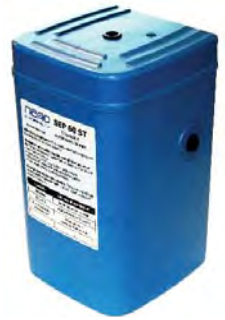
the disposable SEP 60: perfect for small applications