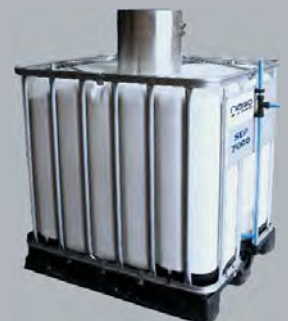
the SEP 3500 & 7000: built for high condensate flow