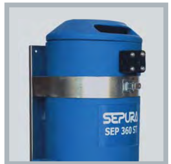
optional wall mounting brackets