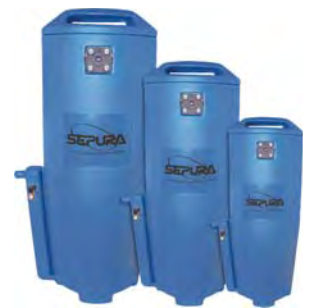
the SEP 120 through 1250: simply clean condensate